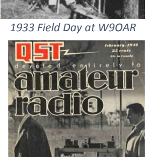
1942 Four-Handy Talkie

depending on power output. The breakpoints were set at 20 Watts and 60 Watts!